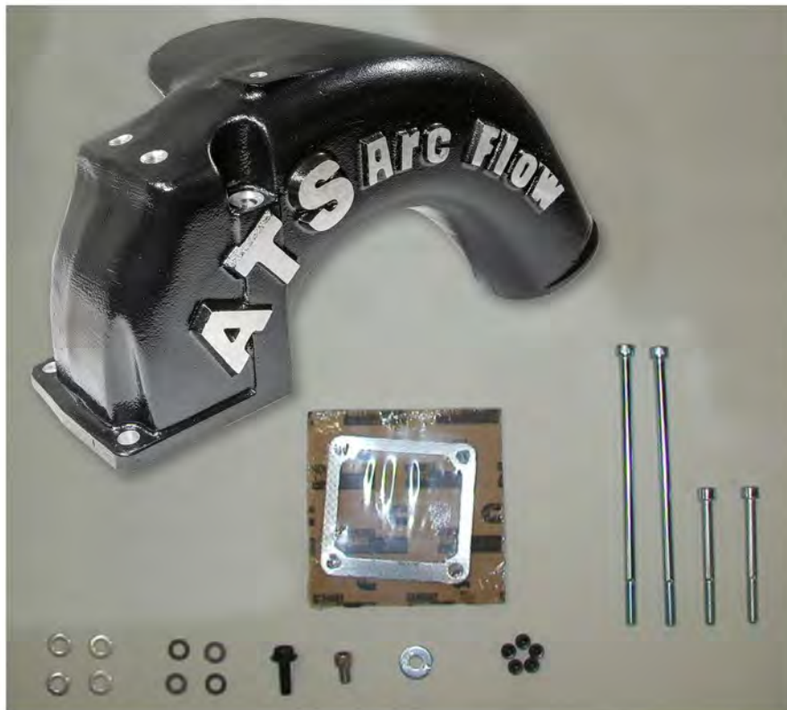
Figure 1 - 24-valve ArcFlow Kit contents

Thank you for purchasing the ATS Arc-flow Intake Manifold. This manual is to assist you with your installation. If installing for a customer, please pass this manual on to your customer for future reference.