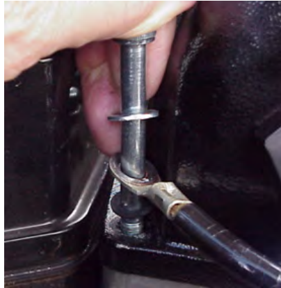
Figure 3 - Installing Ground Wire, Note Rubber Washer Below Ring Terminal