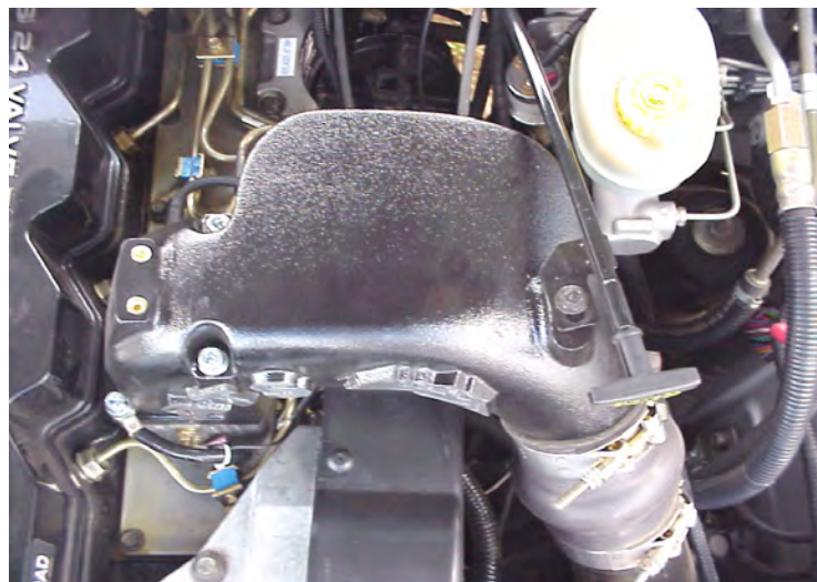
Figure 4 - Arc-Flow Intake Manifold After Installation

Note: Figure 4 shows a 24V Cummins, but 12V and Commonrail models look similar.